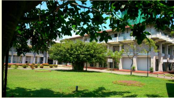
Faculty of Management Studies