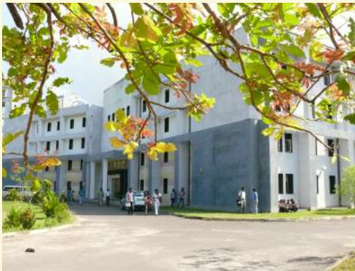
Faculty of Engineering Technology