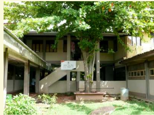
Faculty of Health Sciences