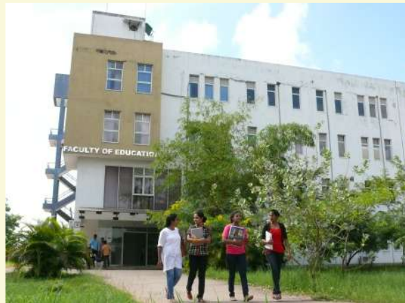
Faculty of Education