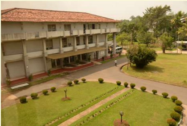
Faculty of Humanities & Social Sciences