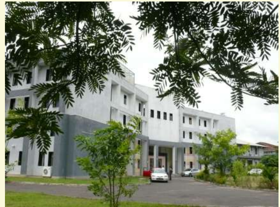
Faculty of Natural Sciences