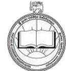
South Eastern University of Sri Lanka